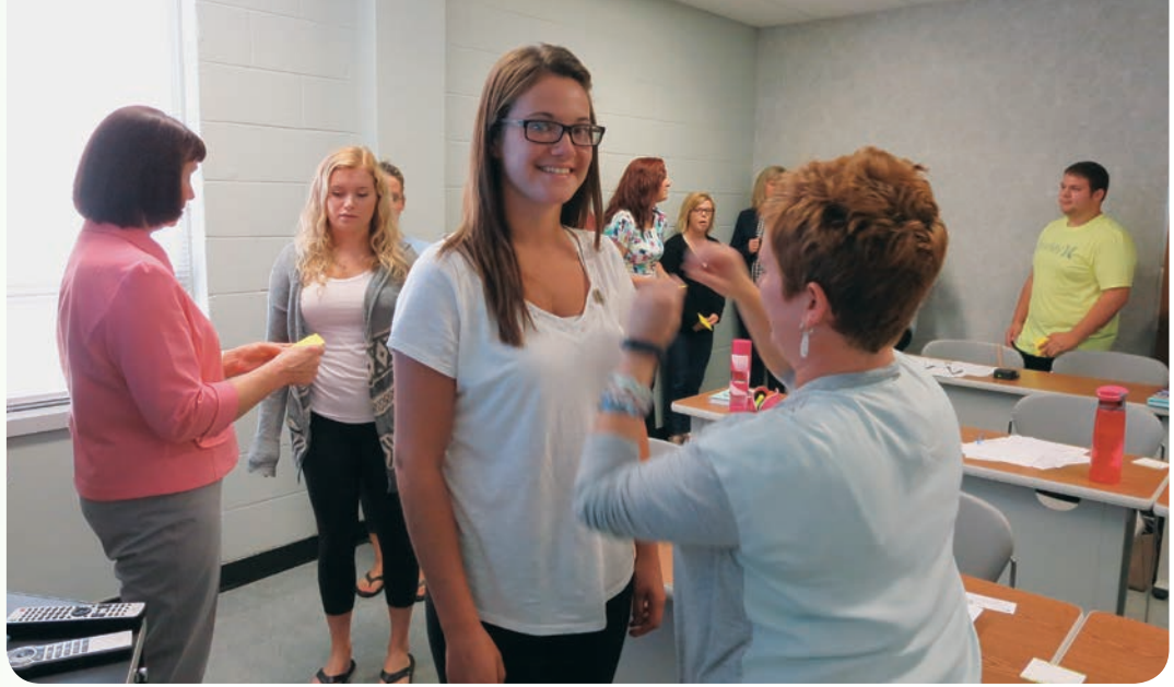
Top image: Yorkton Pinning Ceremony