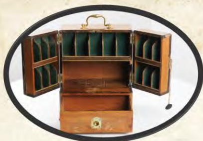
Nightingale Medicine Chest in Canada

UNIVERSITY OF SASKATCHEWAN College of Nursing NURSING.USASK.CA