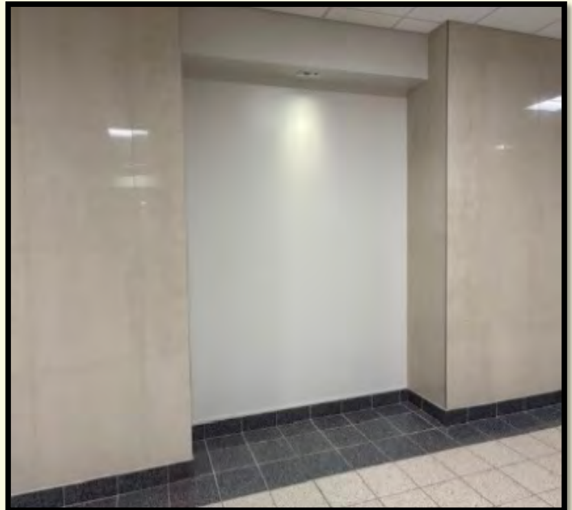
Future Location Wall Alcove - Display case A-Wing Health Sc