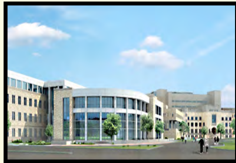
2013 New E-Wing opened. Medicine Chest placed in Dube Health Science Library