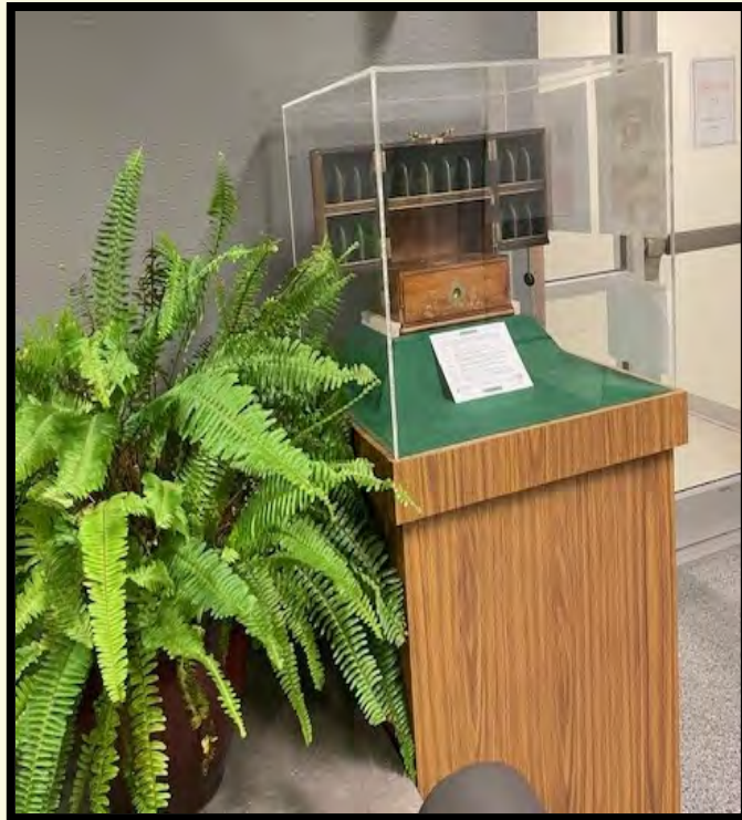
Current Location 5-foot Display Case E-Wing, 4 th Floor Health Sc