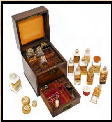
Medicine Chest (Box) Florence Nightingale Museum