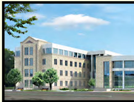
2015 Nightingale Medicine Chest moved to 4 th Floor E-wing