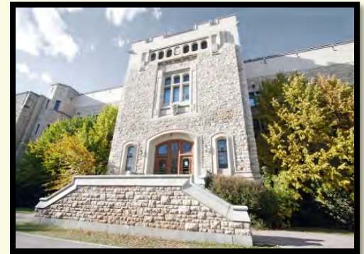
2012 Nightingale Medicine Chest moved to A Wing College of Nursing Admin Offices while Library was renovated