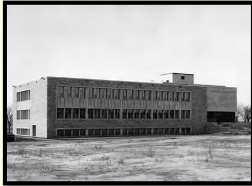
1956 Murray Building opened Murray Memorial Library Ground Floor - SK Archives