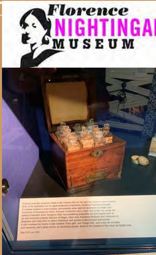
Medicine Box at