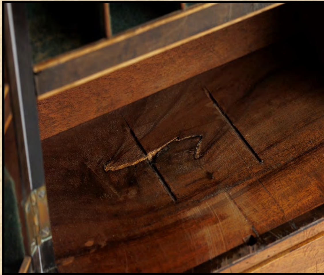
Table Base - Over drawer

This well-worn appearance may provide some credibility or evidence of the medicine chest allegedly was taken to the Crimea by Nightingale because it was well-used at one time? If it was in pristine condition - it would not