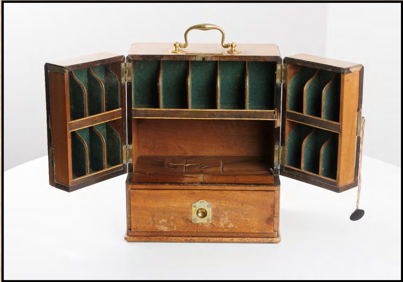
Nightingale Medicine Chest, c. 2022