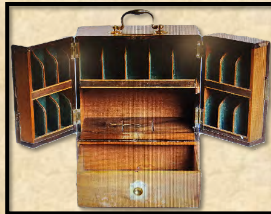
Medicine Chest once owned by FN came to Canada in 1912, now located CoN, USask