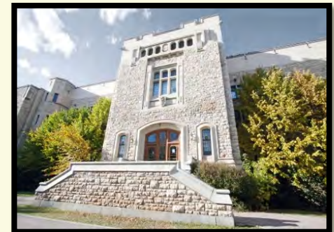
Future: Plans for Nightingale Medicine Chest to be moved to A-Wing Corridor for visibility