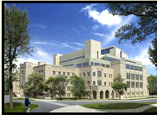
1974 Display Plexiglass Case built and chest place in Health Sciences Library, B-Wing